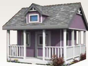
Kids Playhouse 10' x 10' 2655-969