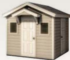
Storage Playhouse Shed 10' x 10' 2861-509