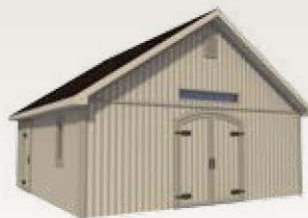
Workshop 20' x 20' 2758-100