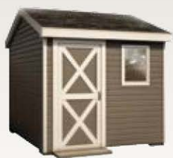
Side Entry Shed 8' x 8' 2864-801