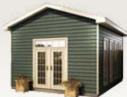
Backyard Office 16' x 20' 2758-101