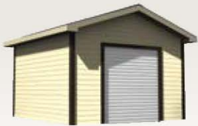
Roll-up Door Shed 10' x 12' 2863-152