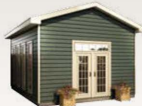
Backyard Office 16' x 20' 2758-101