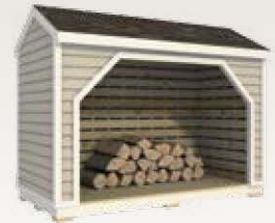
Wood Storage 12' x 12' 2863-604