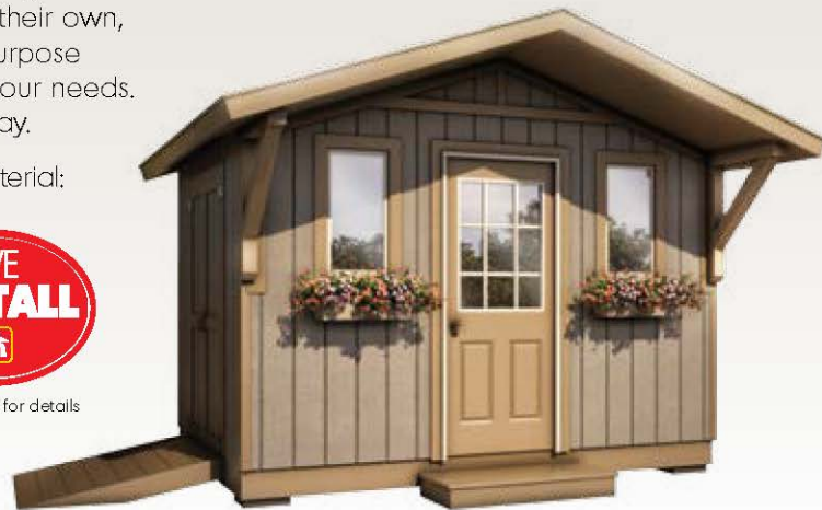
Double Entry Shed 12' x 8' 2758-091