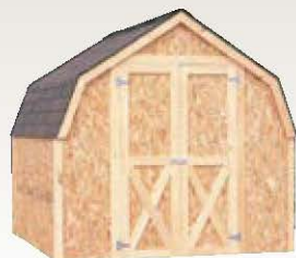
Barn Style Stick Built Shed 10' x 10' 2863-242