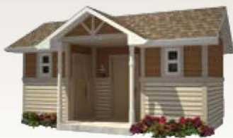
Cabana 20' x 12' 2851-501