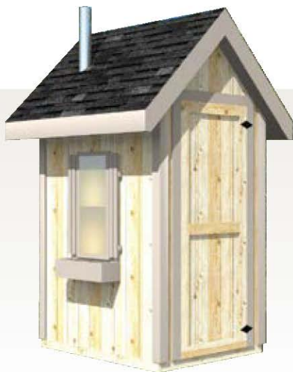
Pit Toilet Outhouse 4' x 5' 2655-971