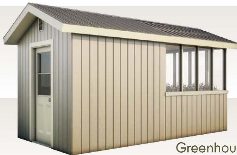
Greenhouse Shed 16' x 8' 2865-030