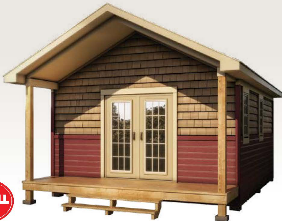
Bunkie with Horizontal Sidelings & Shakes 16' x 20' 2854-859