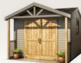
Gable Style with Porch 10' x 10' 2865-023