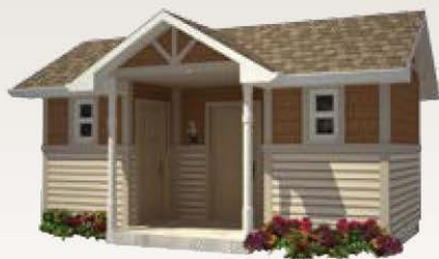
Cabana 20' x 21' 2851-501

There are dozens of projects you can do on your own while at the cottage to enhance your cottage life. They are so simple and easy that you'll want to jump right from one project to the next.