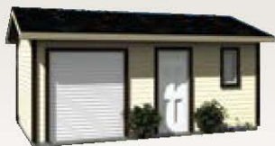
Side Entry Roll-up Door 20' x 12' 2864-809