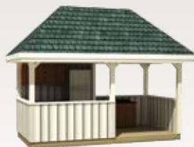
Summer Pavillion 16' x 8' 2853-001