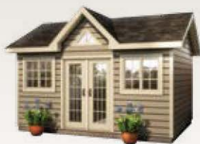
Garden Studio 16' x 12' 2863-505