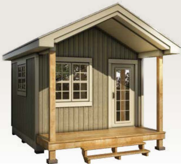
Bunkie with Chalet Sidelings & Pine Trim 12' x 12' 2854-860