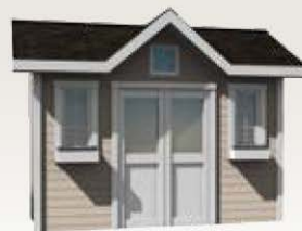
Side Entry Corner Shed 12' x 10' 2863-165