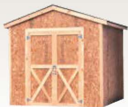
Gable Style Shed 10' x 10' 2863-709

Whether you are a novice or master gardener you'll appreciate the extended growing season offered by a greenhouse.