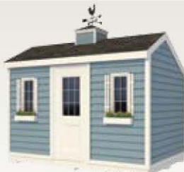
Saltbox Roof Shed 12' x 8' 2758-098