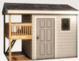
Storage Playhouse Shed 12' x 8' 2861-521