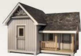
Gable Style with Porch 16' x 12' 2861-523