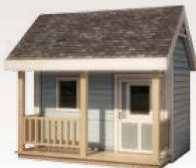
Kids Playhouse 8' x 6' 2861-505