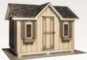
Double Entry Shed 12' x 8' 2865-043