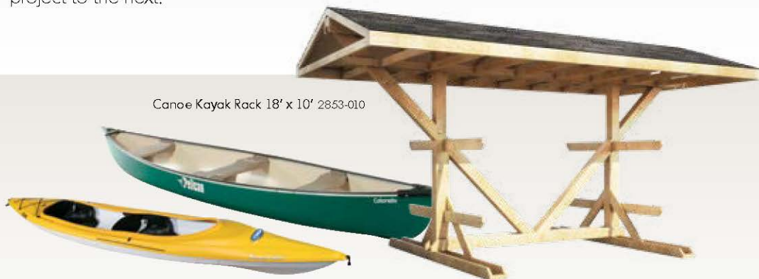
Canoe Kayak Rack 18' x 10' 2853-010