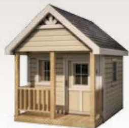
Kids Playhouse 6' x 8' 2861-503