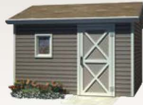
Side Entry Shed 12' x 12' 2864-807