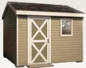
Side Entry Shed 12' x 8' 2864-805