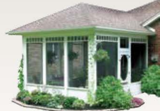
Screened Porch 12' x 12' 2849-401